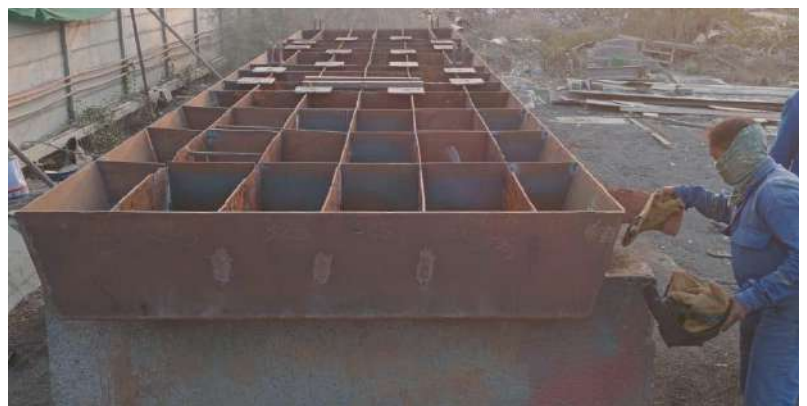
GRATING INSTALLATION AND FENDER STRUCTURE REPAIR WORK AT ADANI PORT