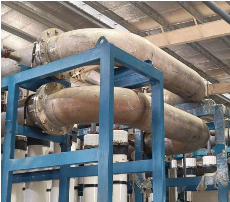
SS PIPING WORK AT WAAREE