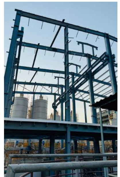
STRUCTURE FABRICATION AND ERECTION WORK AT WAAREE