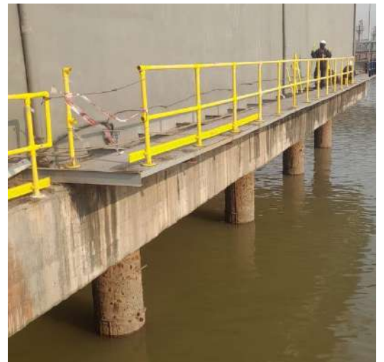
ALLUMINIUM RAILING AT ADANI PORT