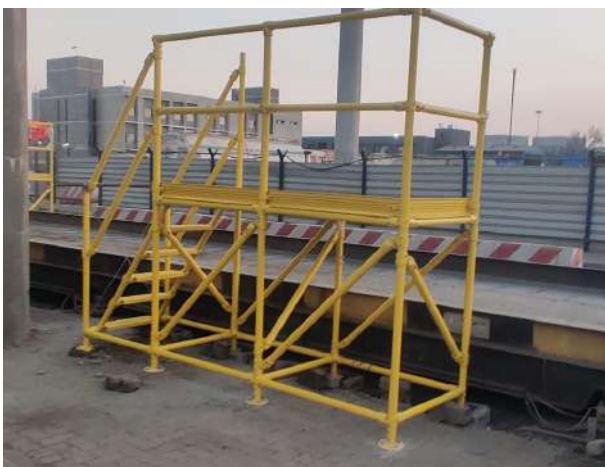
ALLUMINIUM PLATFORM AT ADANI PORT