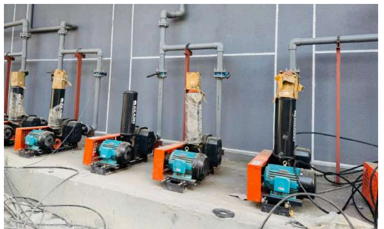
BLOWER INSTALLATION WORK AT WAAREE