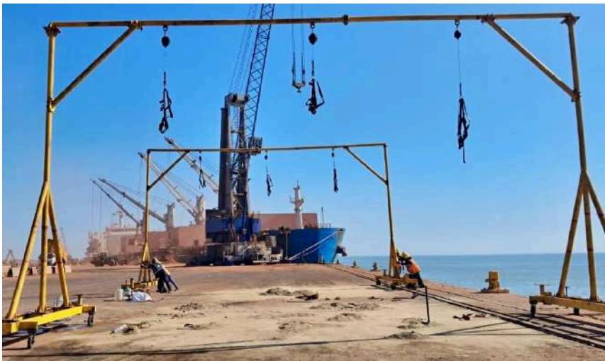
FALL ARRESTOR AT ADANI PORT