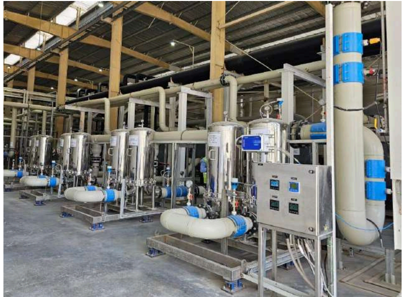
TANK INSTALLATION AND PIPING WORK AT WAAREE