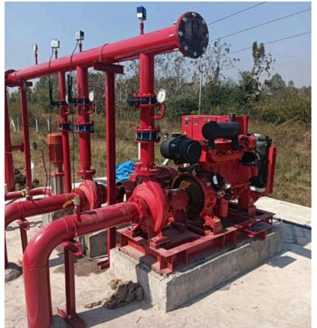
FIRE PUMP INSTALLATION AT DEEPAK NITRITE